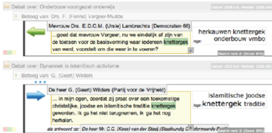
Figure 2: Who uses offensive language in the Dutch parliament?

which we can click and inspect. To follow this semantic link corresponds to implementing the semantic search approach outlined in Section 2. Identifying how often the term ‘ knettergek ’ is used per political party, person, or year is a clear use case for exploratory search in the form of (fuzzy) faceted search. Notice that this implicitly corresponds to the construction of a more complex search strategy under the hood. Once relevant speech portions are identified, we may request a list of people or political parties as result, which illustrates the importance of allowing arbitrary retrieval units as discussed in Section 2.