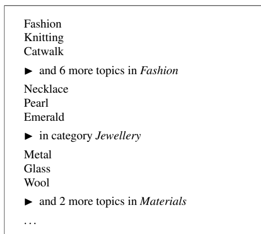
Figure 3: Example of proposed clustered profile layout.

The proposed layout mode has recently been incorporated into a social media platform that is used within several organizations, with the aim of evaluating it longitudinally with real user behavior.